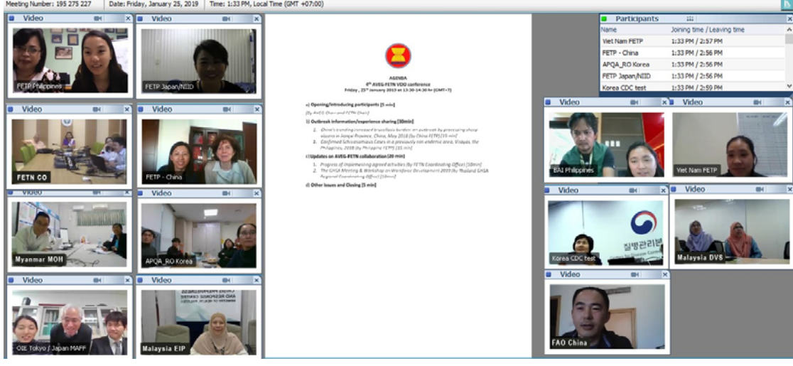
the 4th AVEG-FETN Joint VDO conference was held on 25 January, 2019 13:30-14:45 Bangkok time (GMT+7).

The meeting was coordinated by ASEAN Secretariat, ASEAN+3 FETN Coordinating Office (CO), technical support was provided by Ministry of Public Health, Thailand. The web conference software, "WebEx", was used as the main tool for this meeting.